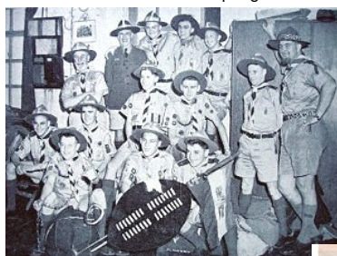
1955 A happy group finally on route to Canada and adventure.